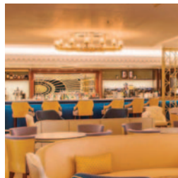
Bars & Lounges